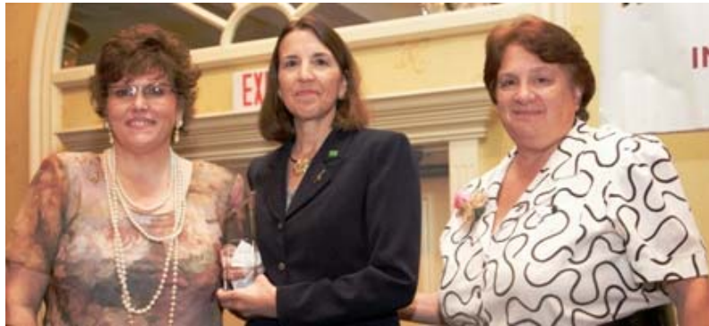
Warren (S Alsofrom was unable to attend)