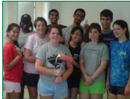
Students from Florida Atlantic University