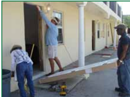
Volunteers installing new doors at Pat Reeves Village