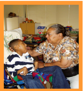
In-home and Center-based Respite Care entering their 20th year at The Arc of PB County