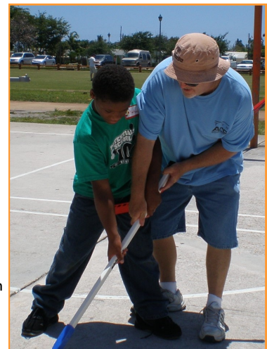
Inclusive hockey, parachute bounce, music, food, fountains and catching up with old friends made the day