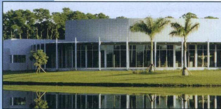
Oscar Schorp Library