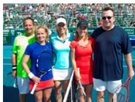
L-R: Jon Lovitz, Elizabeth Shue, Martina Navratilova, Chris Evert and Tom Arnold. Photo from the 2012 Chris Evert/Raymond James Pro-Celebrity Tennis Classic

Comedian Jon Lovitz and ABC-TV's Scandal star Scott Foley headline a group of celebrities who will attend the 2013 Chris Evert/Raymond James Pro-Celebrity Tennis Classic, assisting the tennis legend in her annual fundraiser to prevent drug abuse and child neglect. ESPN will cover all of the action, and will air highlights from the event in 2014 during the Australian Open. This year's event takes place from November 15-17. Tennis will be played at the Delray Beach Stadium & Tennis Center, and the 24th annual