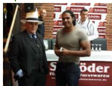
Principals of the TV Show, Goodbye Deutschland , visiting Germany

The German TV show Goodbye Deutschland filmed its first season in West Palm Beach. Goodbye Deutschland follows two German men who have a background in Olympic wrestling and sports, as they begin a new life in America. Cameras followed them as they lived their dream of opening up a restaurant. The show is currently airing on the VOX Network in Germany.