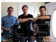
On the Set of Hello, My Name is Frank

Majic Robot Studios located in Lake Worth is doing post-production on the film, Hello My Name is Frank . Hello, My Name is Frank , is a funny and poignant tale about Frank, a man with Tourette Syndrome who is faced with the harsh realities of the world when his caregiver dies. Upon the caregiver's death, a despondent Frank reluctantly embarks on a road trip with the caregiver's teenage daughter and friends, who are worried about leaving Frank alone. Through their adventures, Frank and his companions evolve and grow into their own.