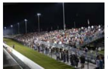
PB Int'l Raceway

Palm Beach International Raceway (PBIR) answers the need for speed with a state-of-the-art motorsport facility. Once the facility gets their Grade 2 Certification, fans can expect Indy Car and Grand Am races to make their way to PBIR. For now the track is open to driving clubs, drag racing, racing schools and has been the backdrop for several television projects. For info visit pbfilm.com .