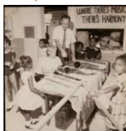
A Table of Instruments at the Conservatory.

Instruments of Change , a one hour documentary by local filmmaker Steve Waxman, premiered on South Florida's PBS Station WLRN Channel 17! Many Palm Beach County (PBC) locations were utilized in the film including the Holiday Inn Express in Boca Raton, the West Palm Beach VA Medical Center, and private homes.