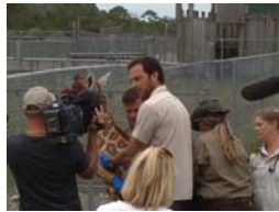
Jobs That Bite filming at Lion Country Safari in Loxahatchee