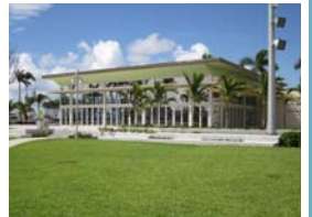
The Lake Pavilion

Swamp Wars . It most recently made a cameo in the filming of Taylor Hackford's latest thriller, Parker , where all three bridges connecting the island to the mainland were lifted simultaneously for a pivotal scene. West Palm Beach is unique in comparison to other locations greatly due to Flagler Drive . The historically charming road lined with lofty Royal palms paired with the intra coastal waterway and the gorgeous, year-round weather are part of what make Palm Beach County a filmmaker's paradise.