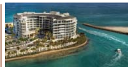
One Thousand Ocean

Full of style, glamour and sparkling sunshine, Palm Beach County (PBC) is synonymous with the Best of Everything way of life. The County is full of unique locations that serve as backdrops for a variety of productions. One of the County's most picturesque locations, One Thousand Ocean , a luxury oceanfront condo building in Boca, hosted tennis superstar and PBC resident Venus Williams . The champion tennis player turned interior designer, struck a pose at the hot spot during a photo shoot for Coastal Living Magazine . Williams designed the model unit at the building. The 31-year-old tennis star, who holds 21 Grand Slam titles and has won three Olympic gold medals, is also the CEO of V Starr Interiors, a full-service design firm she founded in 2002.