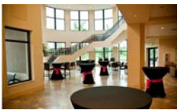
Borland Center in Palm Beach Gardens

Indie film festivals have a rich history of showcasing amazing undiscovered talent, where Hollywood insiders look for the next big thing, where A-list stars promote the small labor-of-love projects they do between blockbusters. This is not the case with the first annual Swede Fest™ Palm Beach. Instead, a "swede" is a no-budget, laughably bad remake of a hit Hollywood film. The term comes from the 2008 comedy, "Be Kind Rewind," which started an underground sweding craze and resulted in the very first Swede Fest™ in Fresno. Next came Swede Fest™ Tampa Bay, and now Mainstreet at Midtown is rolling out the very first Swede Fest™ Palm Beach on Friday, July 27th, 2012 . The event will take place at the Borland Center for the Performing Arts in Palm Beach Gardens .