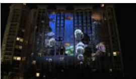
Video Projected on South Tower Condo

A state-of-the-art 3D video produced by Metropolity Productions was projected on the South Tower Condo Building on Okeechobee Blvd. in West Palm Beach, to coincide with the opening of the recent Palm Beach International Boat Show .