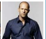
Jennifer Lopez Jason Statham