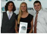
1st Place Commercial/PSA Winners