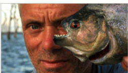
Jeremy Wade on River Monsters

Getting up close and personal with underwater predators is Jeremy Wade , an extreme angler who uncovers the world's strangest and most dangerous fish in River Monsters on Animal Planet .