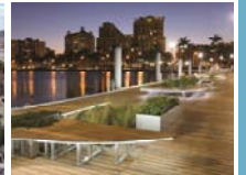
Waterfront in WPB