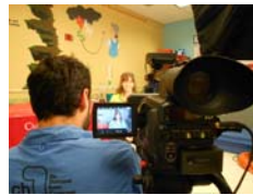
The crew filming at Sugar Sands Park

Best by Kids , the Xfinity on Demand series, produced by Full Moon Creative , out of Sunrise, FL recently shot an entire episode at Sugar Sand Park in Boca Raton! Producers shot segments about the Children's Science Explorium, Willow Theater, Science Playground, Carousel, Nature Trails, Sunday Afternoon Family Movies and Athletics. A staff member even conducted a science experiment that kids can do at home.