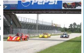
Palm Beach Int'l Raceway

If you have the need for speed, Palm Beach County (PBC) has the right track for your next shoot! Located throughout PBC, the four tracks listed below are sure to get your crew excited, and get their hearts racing. The Palm Beach Kennel Club in West Palm Beach, is a great place to shoot your actors enjoying delectable foods and playing poker while watching their favored Greyhound race to victory. Palm Beach Kennel Club is one of the oldest and most competitive tracks in the country, and has