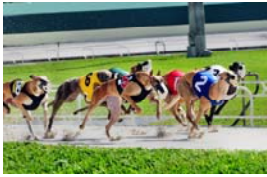
Palm Beach Kennel Club

If you have the need for speed, Palm Beach County (PBC) has the right track for your next shoot! Located throughout PBC, the four tracks listed below are sure to get your crew excited, and get their hearts racing. The Palm Beach Kennel Club in West Palm Beach, is a great place to shoot your actors enjoying delectable foods and playing poker while watching their favored Greyhound race to victory. Palm Beach Kennel Club is one of the oldest and most competitive tracks in the country, and has