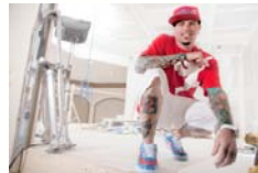
Rob Van Winkle DIY Network

Get ready for Season 2 of The Vanilla Ice Project ! 90's rapper Vanilla Ice , aka the "Ice Ice Baby" hit maker, traded in his microphone for a hammer, for the first season of The Vanilla Ice Project on the DIY Network . Vanilla Ice also known as Rob Van Winkle and a team of handymen renovated a