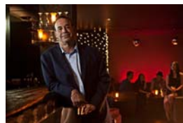
Jon Taffer -- Spike TV

When it comes to the bar business, Royal Palm Beach's Jon Taffer is an internationally recognized, award-winning restaurant operator, owner and concept developer. A 30-year veteran of the industry, Taffer has been tapped to share his expertise on the new Spike TV Show, Bar Rescue .