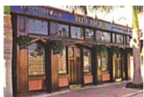
Blue Anchor Pub

Back in the States, the show kept the British theme going, by featuring a segment about the Blue Anchor Pub , a popular British pub in Delray Beach. This 19 th century pub was voted Florida's Most Haunted Pub by The Travel