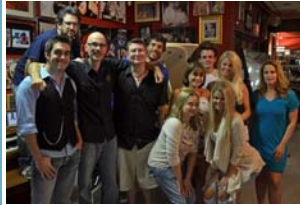
Cast and Crew Photo