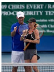
Jeffrey Donovan and Chris Evert

The annual Chris Evert/Raymond James Pro-Celebrity Tennis Classic is back! This year's event will bring together stars from the entertainment and tennis worlds with two days of tennis on Saturday, November 6 and Sunday, November 7 . The tennis will be played at the Delray Beach Tennis Center in Delray Beach and the annual Gala scheduled for Saturday, November 6, will once again be held at the Boca Raton Resort and Club in Boca Raton .