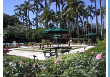
Giant Chess Set

nate cypress. The Tower opened in 1969 and is still considerably taller than any other building in southern PBC. It's famous "Boca pink" color has made it famous and the Resort is commonly referred to as the "pink hotel". Other sections that make up the Resort & Club consist of the Yacht Club, Boca Beach Club which reopened in 2009 after a major $120 million renovation, the Bungalows and the Boca Country Club. The Resort has hosted productions such as All My Children and numerous high-end fashion shoots. For more info call 561.233.1000.