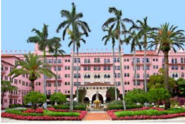
Boca Raton Resort and Club

Situated on 356 acres in Boca Raton, in southern Palm Beach County (PBC), the Boca Raton Resort & Club is one of the country's premier resort destinations and private club facilities. With a tropical climate year-round; an average temperature of 73 degrees Fahrenheit in winter and 83 degrees Fahrenheit in summer, the Resort is a perfect location for your next production.