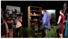
Filming of Book Deal

Actors from the Master Acting Class at the Burt Reynolds Institute for Film & Theatre (BRIFT) went before the new REDCAM at Palm Beach State College (PBSC) for the first in a series of short films being co-produced by the two film training organizations.