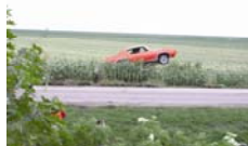
Car stunt in Pahokee

Locations included private homes in the Millpond Neighborhood of Boca Raton , a private cornfield and State Market Road in Pahokee , which was shut down for a special car stunt. The band Fall Out Boy also got in on the action by performing in Belle Glade to hundreds of extras during a scene that recreated an Amish Rumspringa party. Producers chose to film in Palm Beach County because of its versatile looks and ability to double for spots in the mid-west of the U.S. For more info call 561.233.1000.