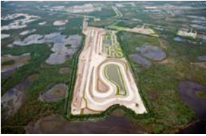
Aerial view of Moroso

Reopening this month, and located in Jupiter on over 200-acres, Moroso Motorsports Park just completed a multi-million dollar overhaul of a dated racetrack into a world-class motorsports park. Moroso offers various amenities to fit any speed seeking production needs. Productions are welcome to use a two mile, 11-turn, 40-foot wide, custom engineered asphalt road course built to FIA specifications. In addition, the road course features soft wall barriers to compliment the tire barriers and concrete walls, along with