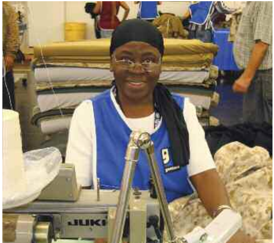
Producing and packing blankets that were donated to Haiti.