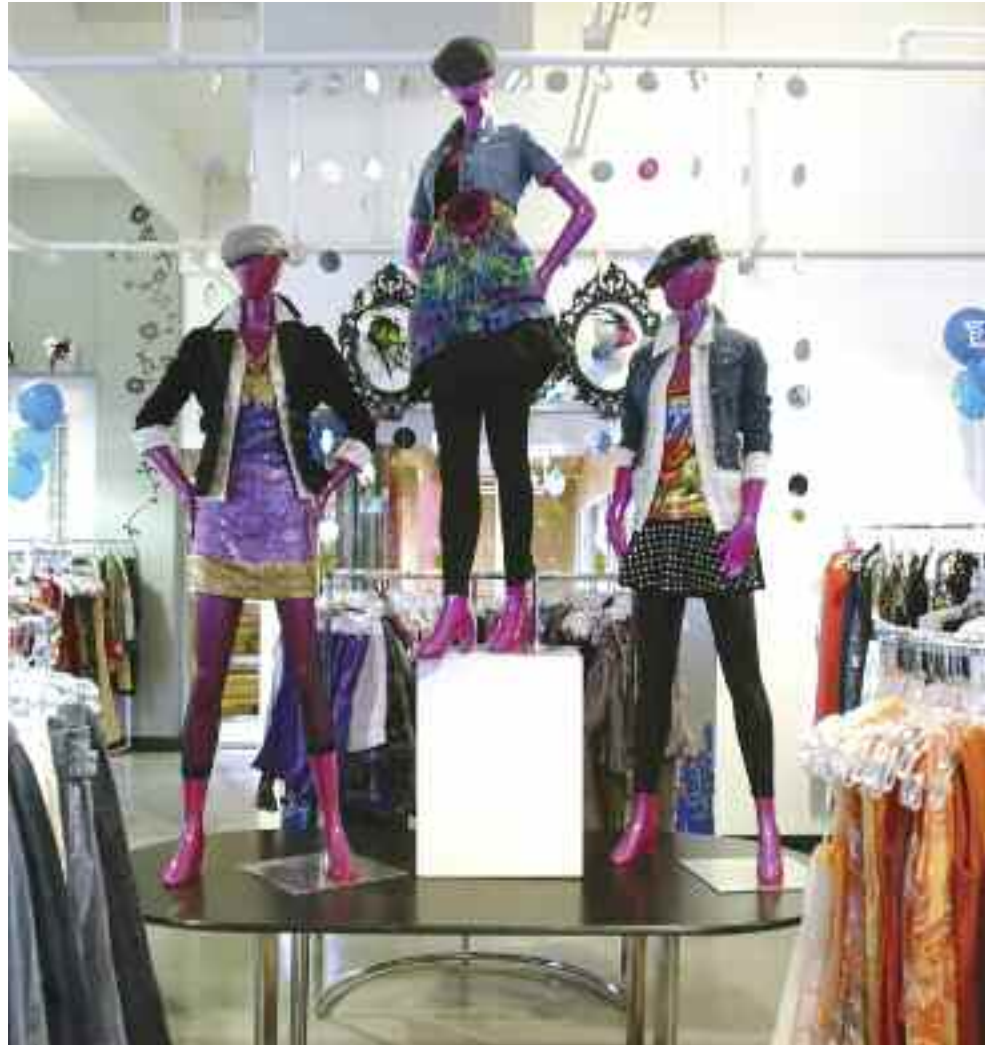
Our Junior Department offers trendy, bold, unique styles for a one-of-a-kind youthful look.

Our Goodwill stores remain a social enterprise, with a fresh twist.