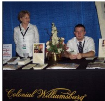
(Above) Colonial Williamsburg's booth at the 2011 Expo in the Williamsburg Woodlands Conference Center. (Left and below) 2011 Post-Race Bash in the Sunken Garden on the William and Mary campus.