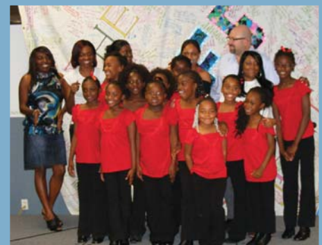
World AIDS Day "People with Voices Talent Show" first place winners Baby Divas Step Dance Team.