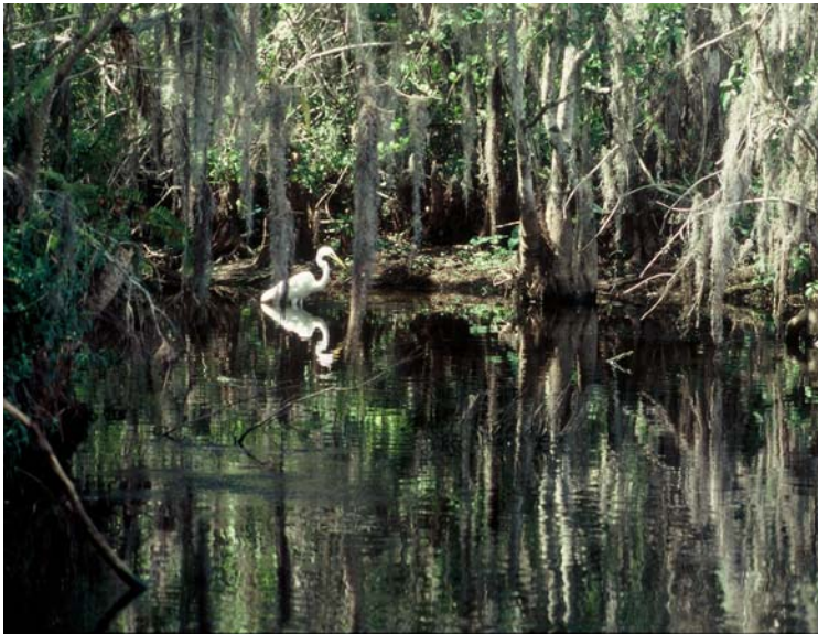
Swamp and Great Egret by Tom Sterling